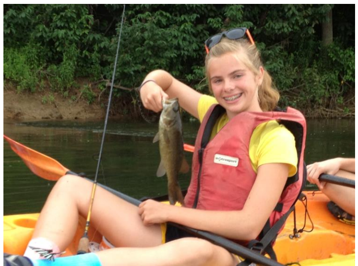
Fishing on the Potomac River