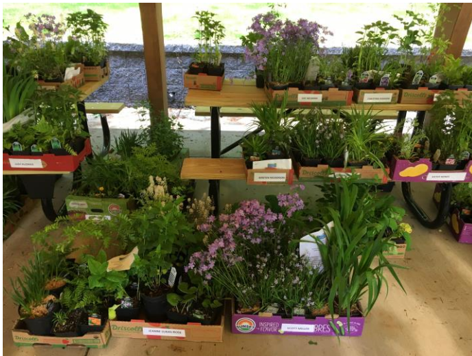
Preorders sorted and awaiting pickup

The Friends of Riverbend Park's annual Native Plant Sale was held on Saturday, May 4 th at the park's newly opened Outdoor Classroom and Picnic Shelter on Potomac Hills Street. The new structure proved to be perfect, both for the pickup of preorders on Friday, May 3 rd and for the sale itself the next day. Six FORB Directors were on hand to make sure that customers received their proper orders, to give planting advice, and to ensure that the sale was a great success.