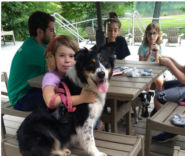
Kids enjoy the Doggone Fun! Camp

Summer is a very busy time at Riverbend Park. The trails are crowded with hikers, the river is filled with kayakers and canoeists, fisherman are found along the banks and out in their boats, and dog-walkers and picnickers are everywhere. However, the most important part of a successful summer at Riverbend Park is its booming summer camps. These camps are week-long adventures for kids ages five and older which immerse them in nature and engage them in a variety of educational experiences incorporating the principles of STEAM (Science, Technology, Engineering, Arts and Mathematics) and emphasizing outdoor recreation, environmental sustainability, natural history and cultural history. Of great importance to Riverbend Park is the fact that the summer camps are the largest single source of self-generated revenue for the park, and thus support its resource management projects and other non-revenue producing programs which are necessary for the sustainability and future of Riverbend.