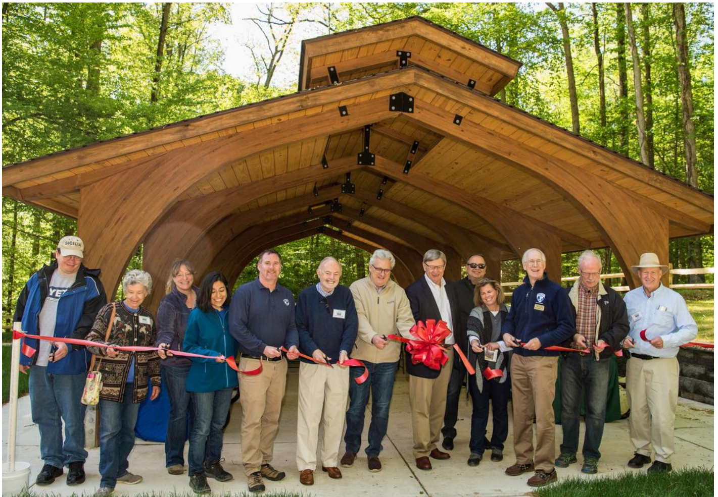
FORB Members, Riverbend Park personnel, and Fairfax County Park Authority staff at the ribbon-cutting ceremony opening the Riverbend Park Outdoor Classroom and Picnic Shelter.

2019. The shelter will also be available for rentals to private parties and can hold up to 60 participants. It is expected to see considerable service for field trips for school children, and greatly increase the park's ability to carry out large programs in an attractive setting surrounded by the forest. Parking is provided for about 20 cars and a school bus. A trail is also planned to connect the Outdoor Classroom directly with the parking lot and picnic areas at the Visitors' Center.