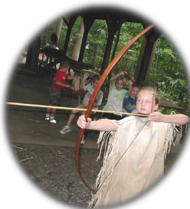
Learning Native American Archery Skills