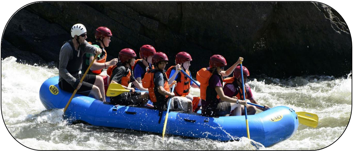
White Water Rafting on the Potomac River

after-camp care options. Riverbend Park is the only riverfront staffed park in the Fairfax County Park Authority.