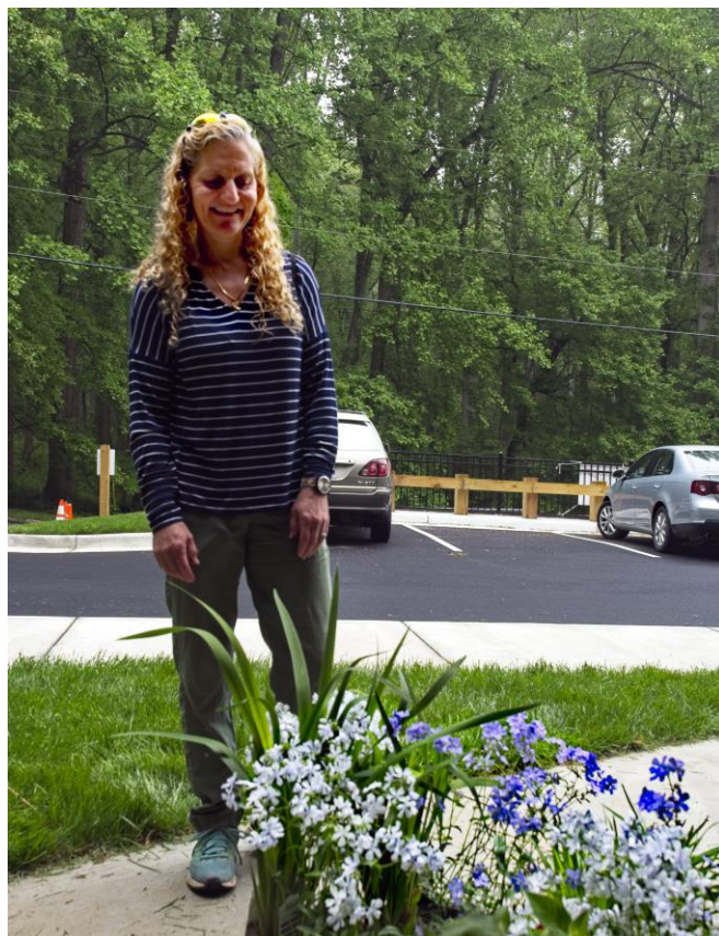
A happy Native Plant Sale customer